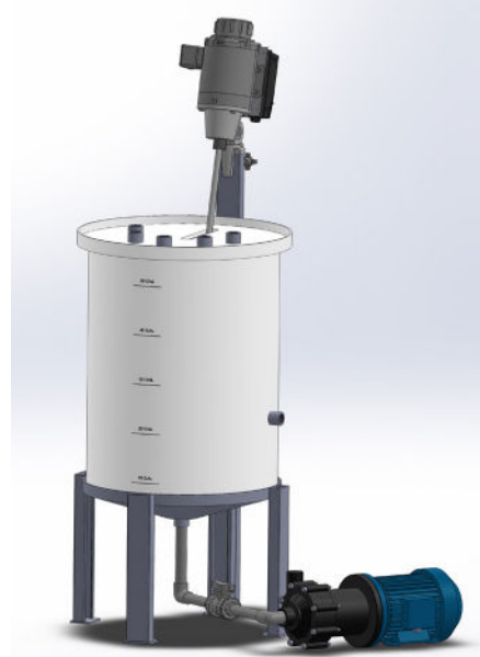
Shown = 50gal HDPE tank, with C clamp mixer, ball valve, and pump, fittings to suit