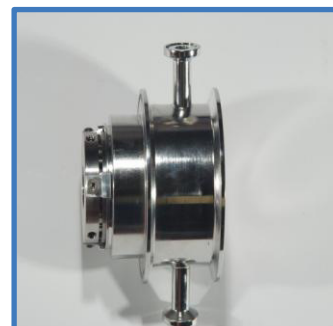
Aseptic Mechanical Seal