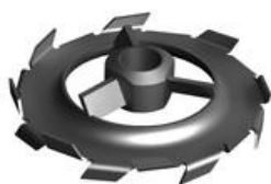
High Shear Impeller