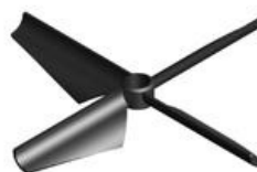
CIP Friendly Impeller