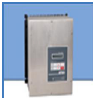
Mixer Speed Controller